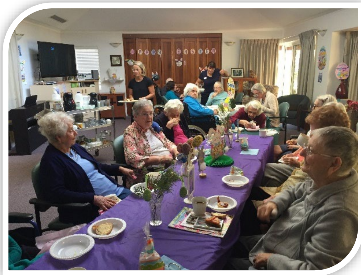
Above: The Resident's enjoying Easter Afternoon Tea.