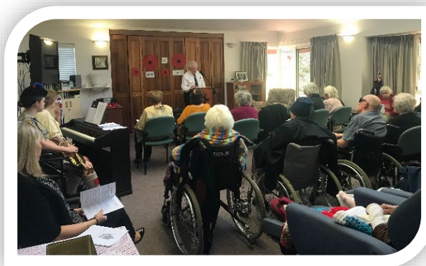
Above Right: Resident's attending the Anzac Day Service.