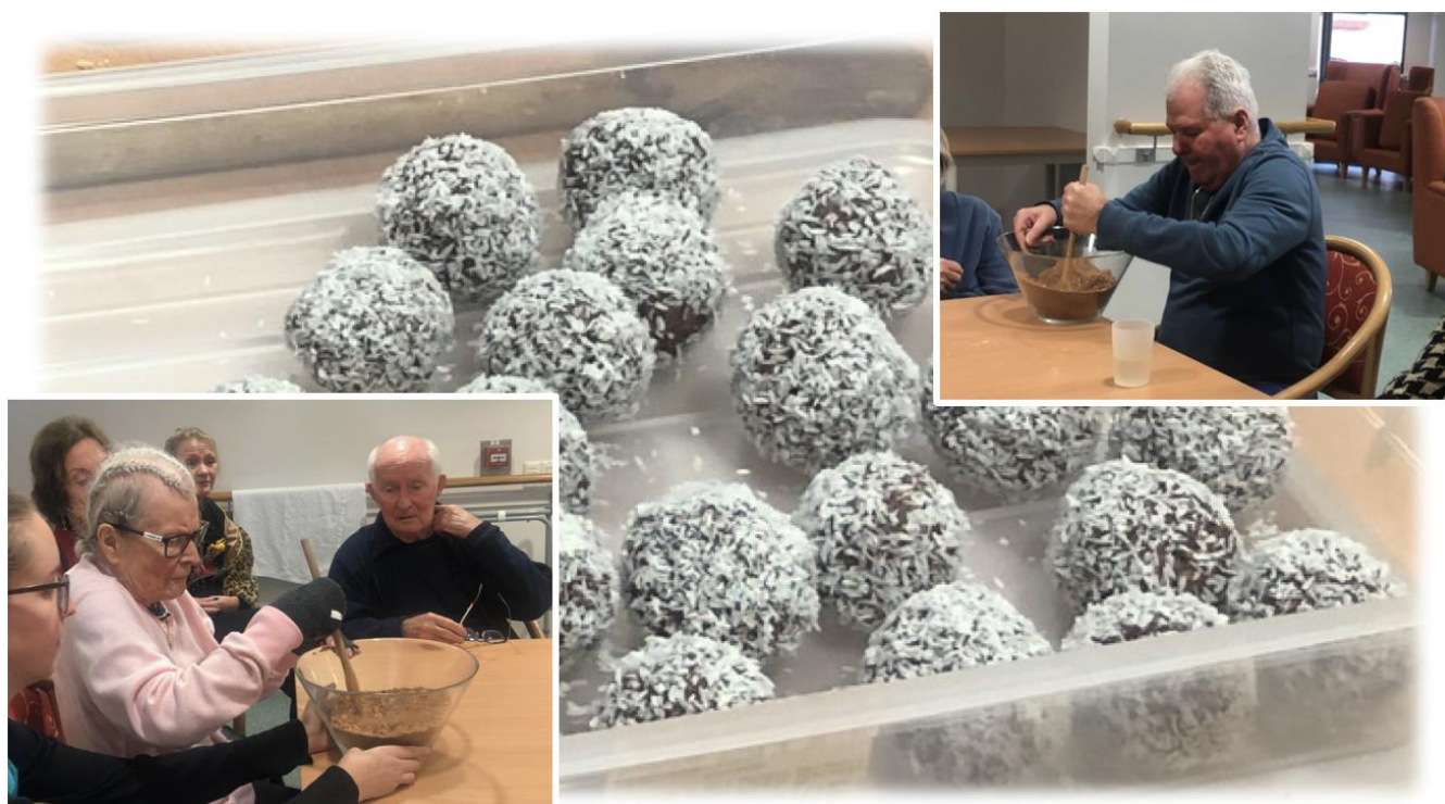
Above: Residents making chocolate coconut balls.