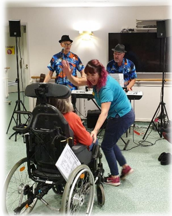
Above Left: Residents had wheelchair dancing in upbeat music.